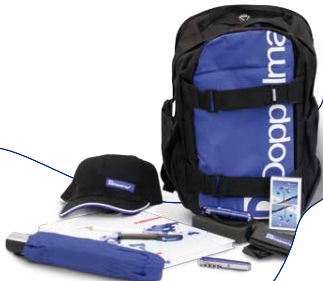
Your Doppelmayr package