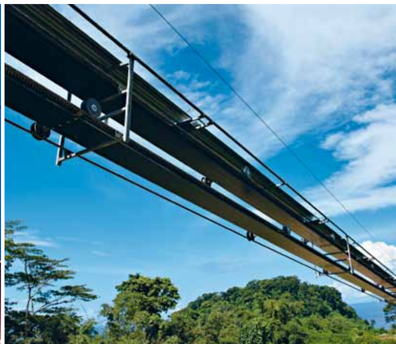
RopeCon® – Simberi, PNG