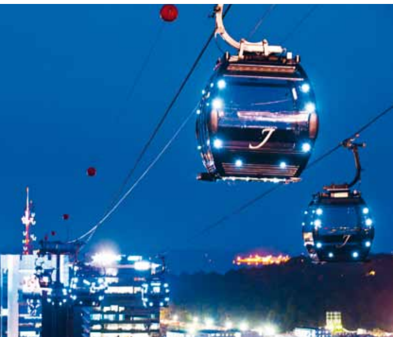
Detachable gondola lift – Singapur, SGP