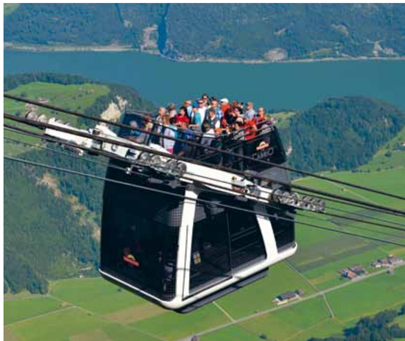
Reversible aerial tramway – Stans, CHE