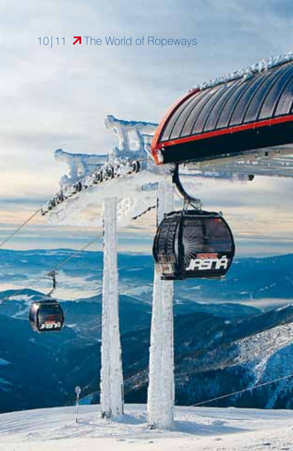
Detachable gondola lift – Demänorská dolina, SVK