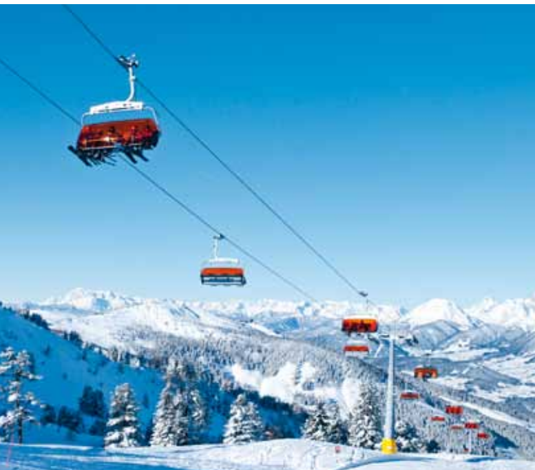
Detachable chairlift – Haus im Ennstal, AUT