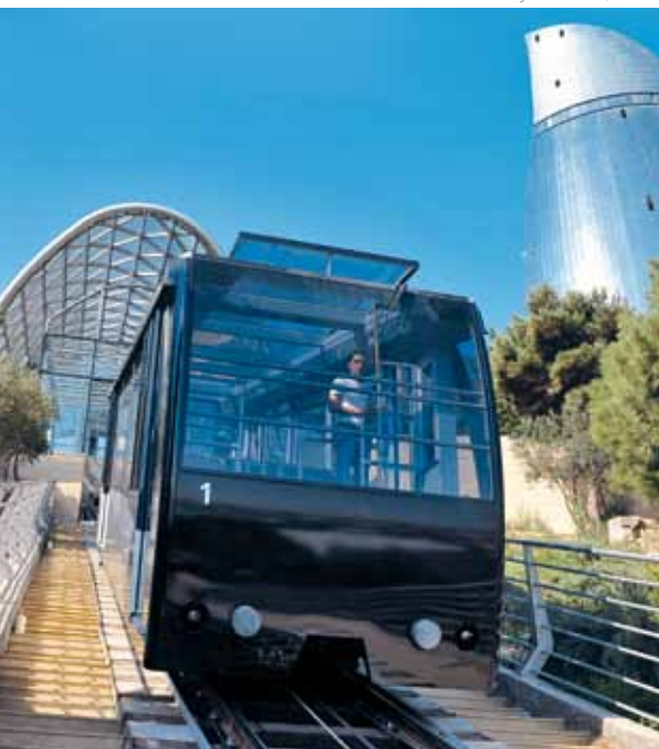
Funicular railway – Baku, ASE