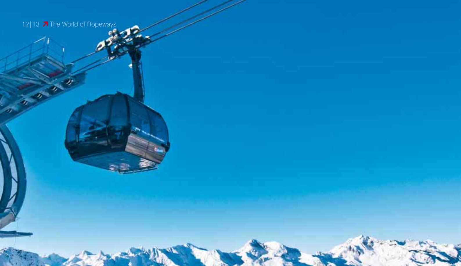
3S gondola lift – Sölden, AUT